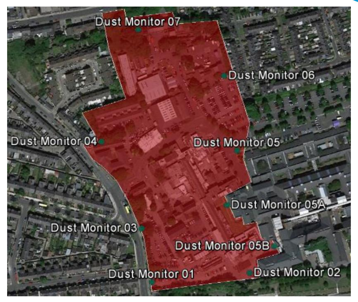
Figure 2. Previous location of Dust monitors on site (April 2017 to August 2017).